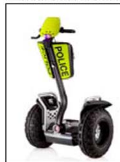
Available as both i2 Patroller and x2 Patroller