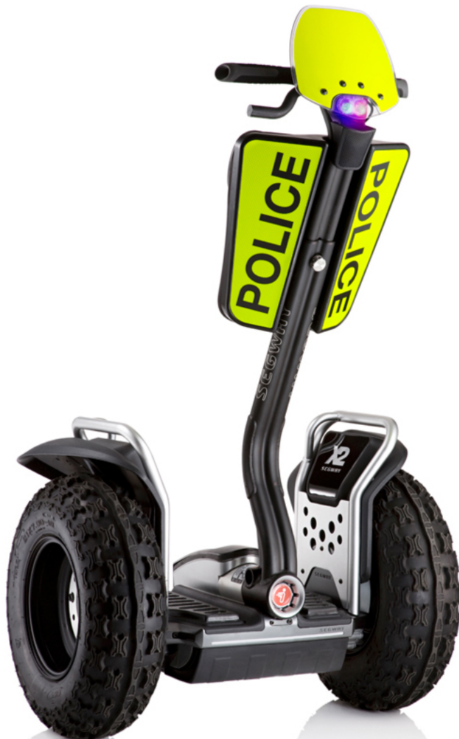
Shown with optional accessory bar