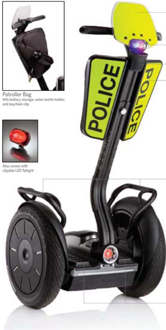
Upper Reflective Shield Provides location for department insignia