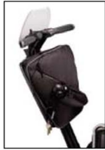
Patroller Bag With battery storage, water bottle holder, and keychain clip